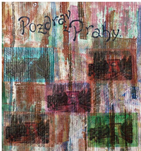
Jana Haklova, samples from the Bridges collection