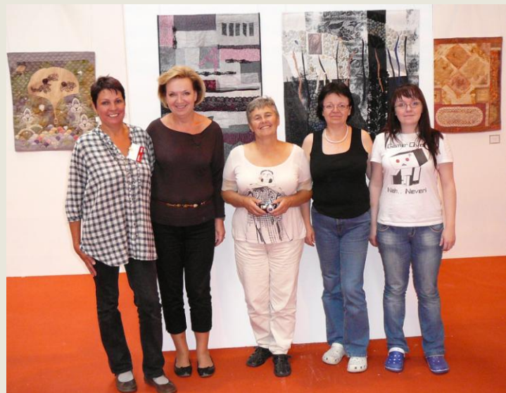
Prague Patchwork Meeting on the Festival of Quilts, Birmingham, 2011