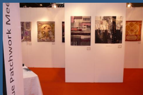
Exposition of Prague Patchwork Meeting on Festival of Quilts, Birmingham, 2011